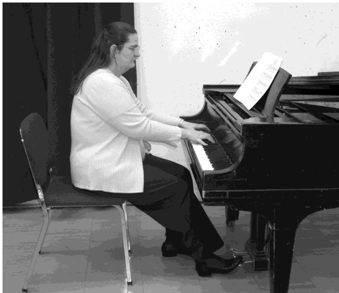
Figure 1. Video Camera Placement: Piano, Keyboard, Harp

Note: The functional keyboard proficiency exercise must be performed on an acoustic piano.