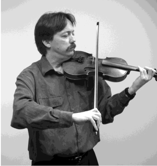
Figure 2. Video Camera Placement: Other Instruments

The video camera should be positioned to show your hands and face ( front or front/side view ).