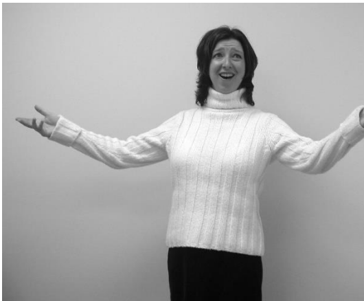
Figure 4. Video Camera Placement: Voice

The video camera should be positioned to show your face and upper torso ( front view ).