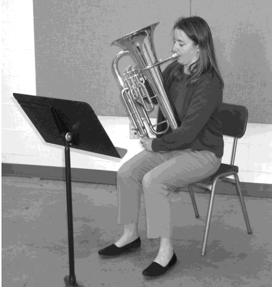
Figure 3. Video Camera Placement: Music Stand

If you read from the assigned score rather than memorize the music, ensure that the music stand does not obscure any of the required views shown on these pages.